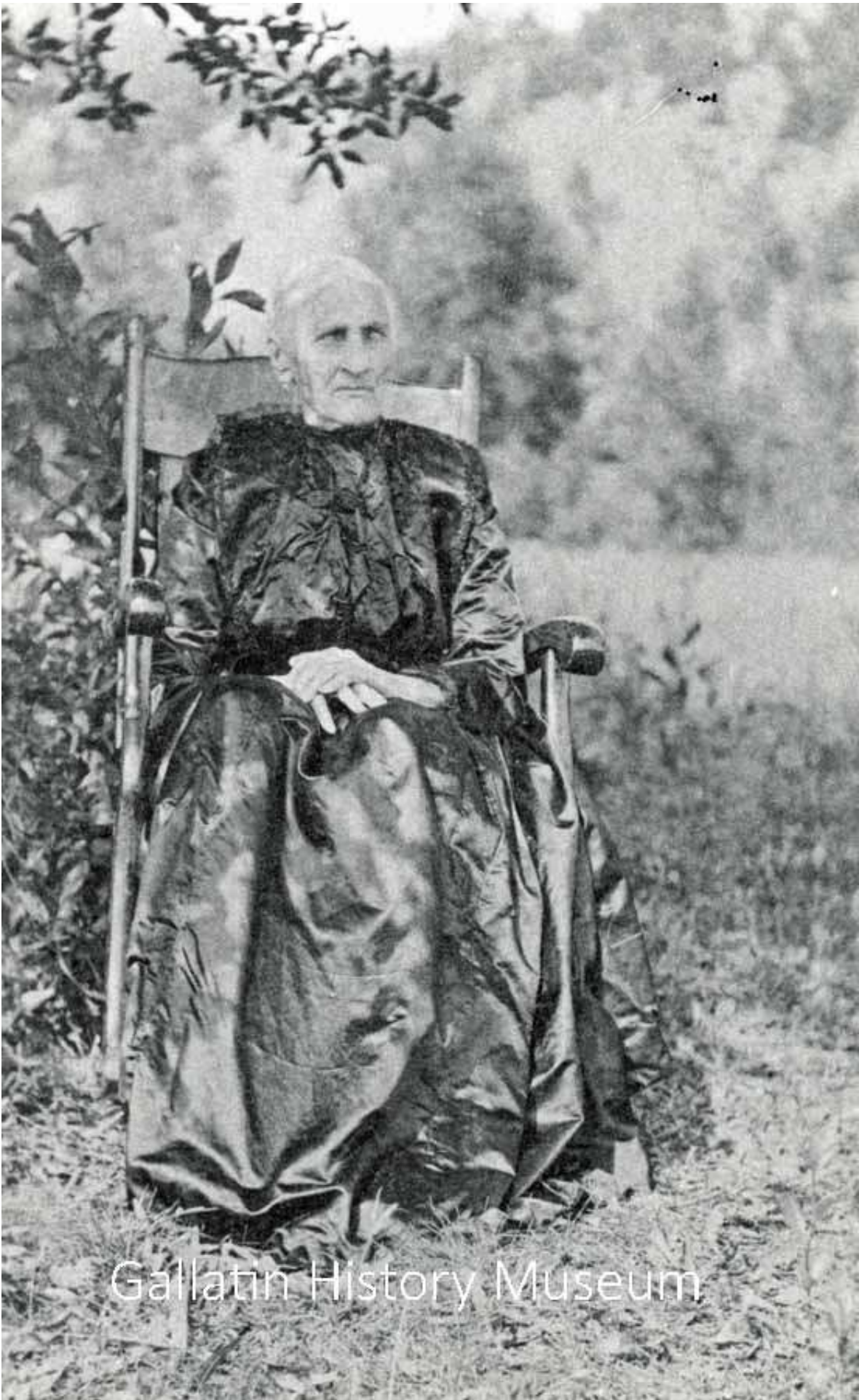
Gallatin History Museum