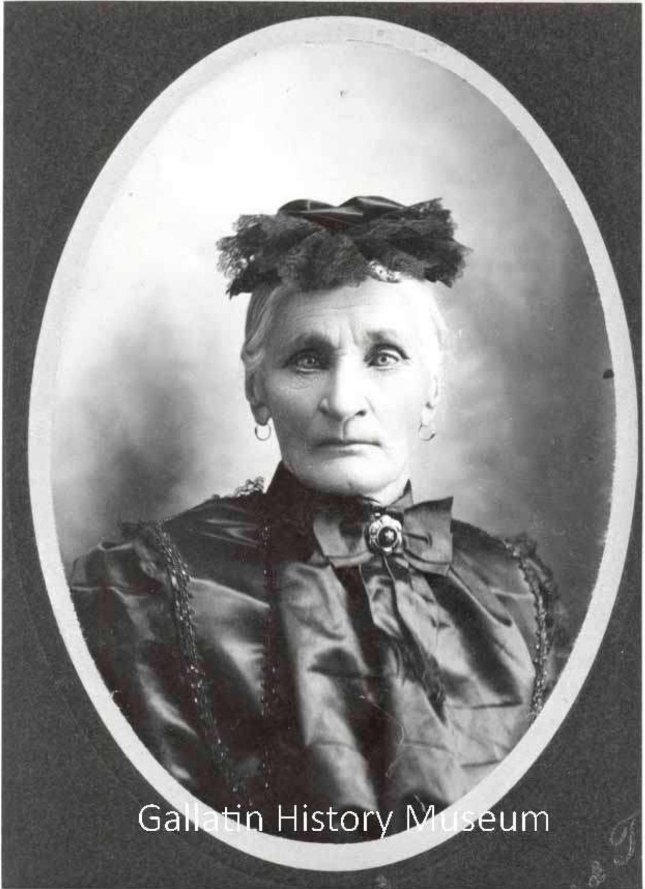
Gallatin History Museum